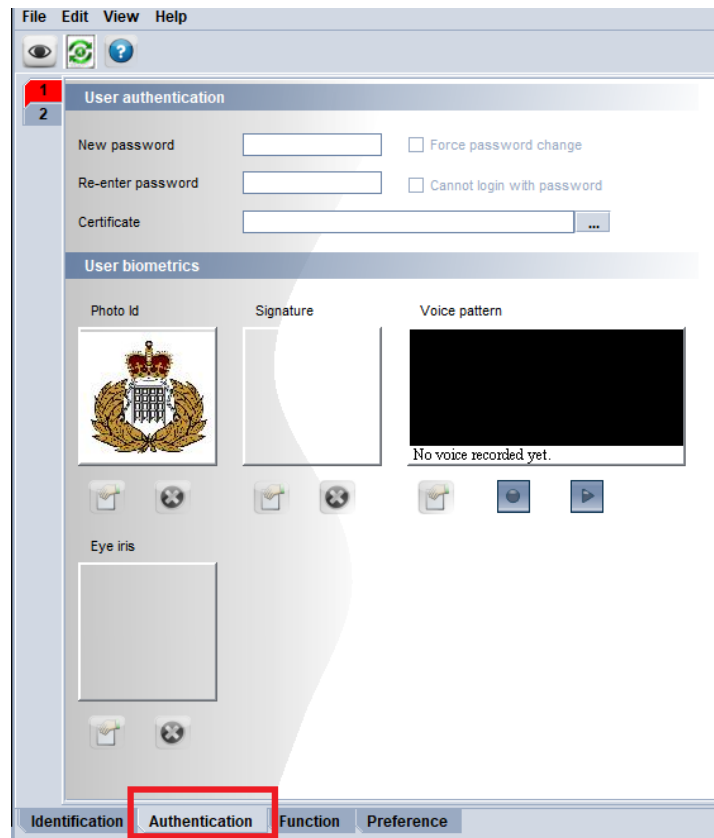
Figure 3 - Authentication tab

3. A new window will pop up. Click on the Authentication tab which is located at the bottom of the window.