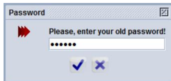
Figure 4 - Password prompt

Note: Keep your password safe and do not share with any other user.