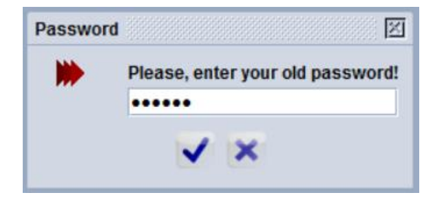
Figure 4 - Password prompt

Note: Keep your password safe and do not share with any other user.